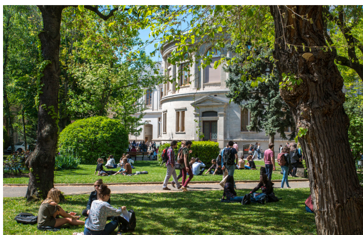
University Lyon 2, conference venue